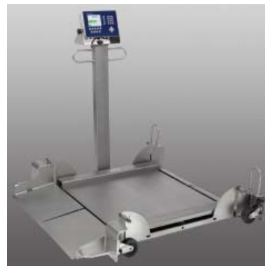
Stainless steel DECKMATE floor scale for sanitary applications.

Our load cells are approved for use in hazardous areas in most markets. DECKMATE load cells carry Factory Mutual, European Ex, and Canadian CSA Ex approvals when used with a METTLER TOLEDO intrinsically safe terminal.